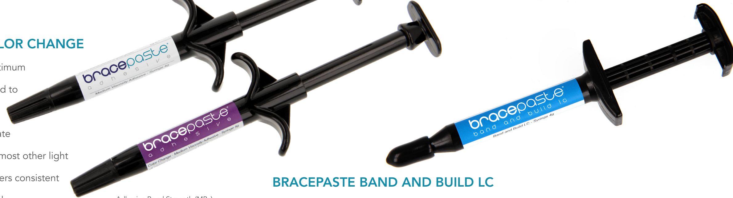
Adhesive Bond Strength (MPa)

BracePaste Color Change has the same familiar feel and workability of BracePaste but its purple color turns translucent upon curing for ease of clean up and enhanced placement of brackets.